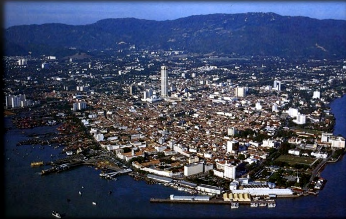
GEORGE TOWN, PENANG