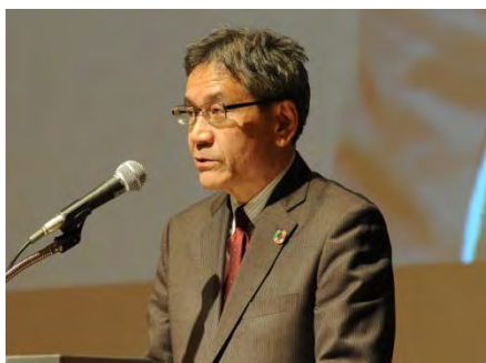
Yasuo Takahashi, Vice Minister for Global Environmental Affairs, Ministry of the Environment, Japan