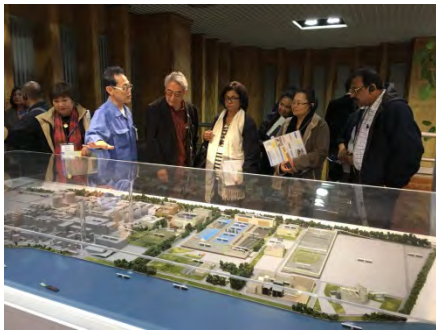
Hokubu Sewerage Center

Locations: Hokubu Sewerage Center, Environmental Planning Bureau (1-6-8 Suehirocho, Tsurumi-ku, Yokohama) Kohoku Newtown (Tsuzuki-ku, Yokohama)