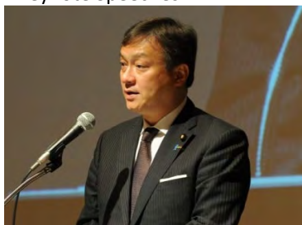
Iwao Horii, Parliamentary Vice-Minister for Foreign Affairs, Japan